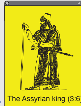
The Assyrian king (3:6)