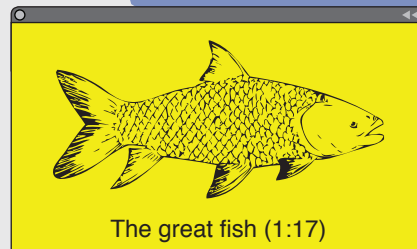
The great fish (1:17)